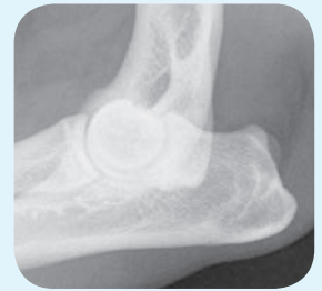
X-ray of a normal elbow joint

Radiography is commonly used to investigate joint problems.